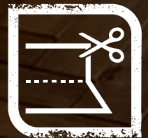
CUT & FOLD